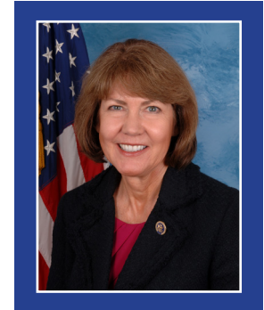
Ann Kirkpatrick, Democrat Challenger, currently U.S. Representative for Arizona's 1st District